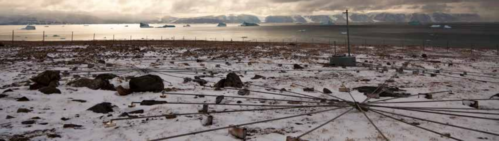
The CTBTO's infrasound station IS18 in Qaanaaq, Greenland, one of the stations that detected the Chelyabinsk meteorite on 15 February 2013.

»Statistically, something this size hits the Earth approximately once every 50 years (though nothing this size or larger has been observed to hit the Earth since 1908). This event was nearly ten times as energetic as the Sulawesi, Indonesia fireball of 2009.«