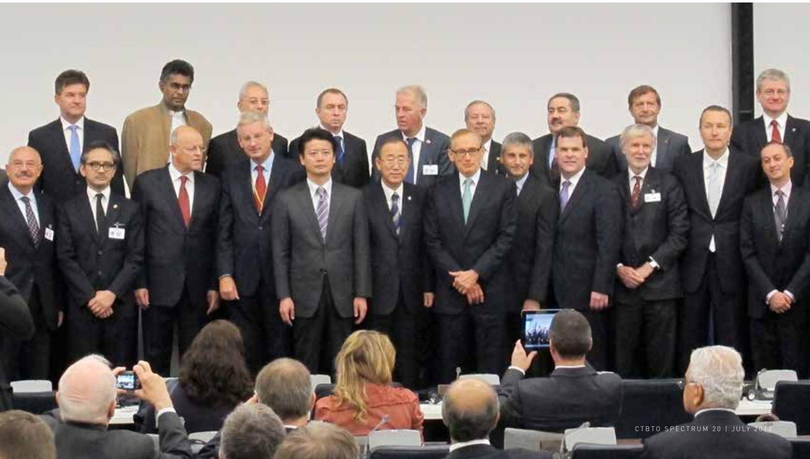
Foreign ministers attending the sixth CTBT Ministerial Meeting on 27 September 2012 in New York, USA. Foreign Minister Hoshiyar Zebari is standing in the back row third from right.

The world has witnessed the tragedies caused by the use of nuclear weapons and other WMD during the past century. We have also witnessed so far in the 21 st century the devastating aftermath