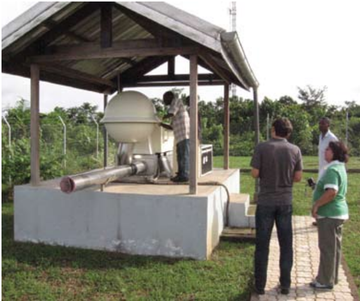
RADIONUCLIDE STATION 13, EDEA, CAMEROON