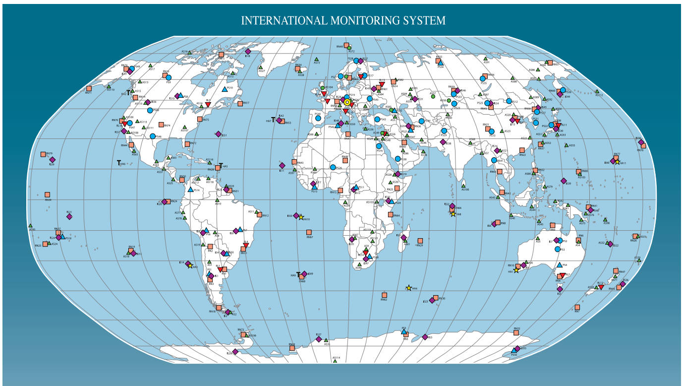
A ONE BILLION U.S. DOLLAR INVESTMENT AND UNTAPPED RESOURCE FOR CLIMATE CHANGE MONITORING: THE 337 MONITORING FACILITIES OF THE CTBTO

The International Monitoring System (IMS) is a global network comprising 337 facilities that monitor the entire planet. These facilities send monitoring data to the International Data Centre (IDC) in Vienna via an independent global communications infrastructure. At the IDC, the data are analyzed and distributed to over 100 countries.