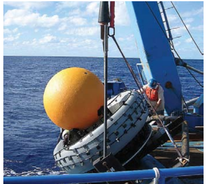
DEPLOYMENT OF HYDROPHONE AT HYDROACOUSTIC STATION 11, WAKE ISLAND, USA