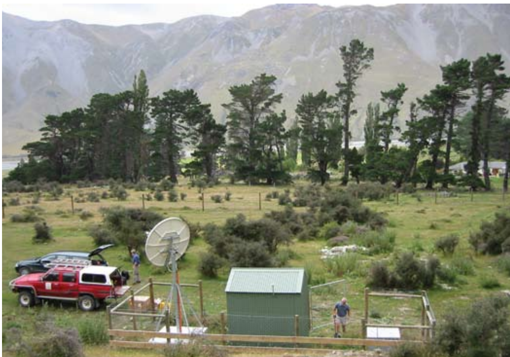
AUXILIARY SEISMIC STATION 69, RATA PEAKS, NEW ZEALAND