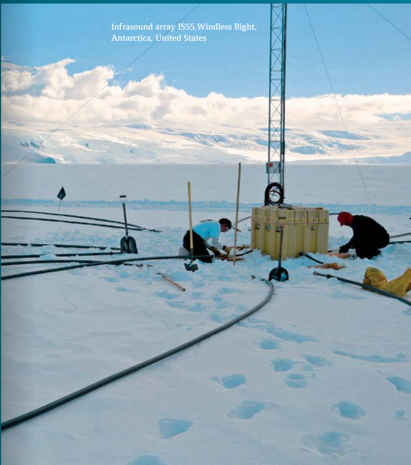
Infrasound array IS55, Windless Bight, Antarctica, United States

The infrasound network of 60 stations uses microbarometers (acoustic pressure sensors) to detect very low-frequency sound waves in the atmosphere produced by natural and man-made events. The data enable the International Data Centre (IDC) in Vienna to locate atmospheric explosions and distinguish them from natural phenomena such as meteorites, explosive volcanoes and meteorological events or man-made phenomena such as re-entering space debris, rocket launches and supersonic aircraft.