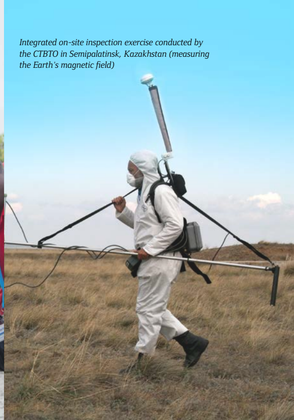
Integrated on-site inspection exercise conducted by the CTBTO in Semipalatinsk, Kazakhstan (measuring the Earth's magnetic field)