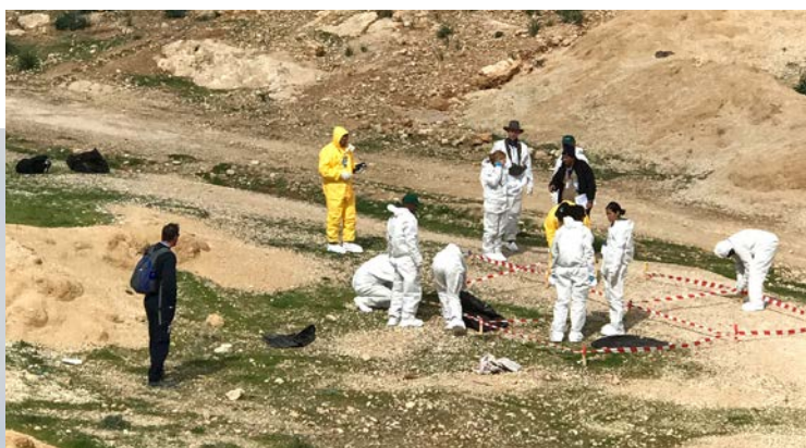
RIGHT: Integrated on-site inspection exercise carried out near the Dead Sea area of Jordan