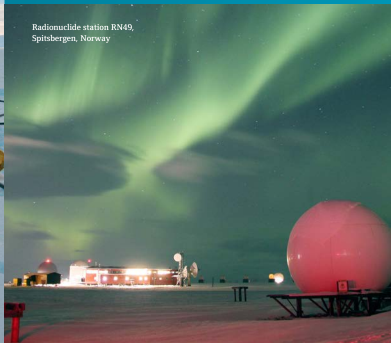
Radionuclide station RN49, Spitsbergen, Norway

The radionuclide network consists of 80 stations which use air samplers to detect radioactive particles released from atmospheric nuclear explosions and those vented from shallow underground or under water explosions. Half of these stations will also have the capacity to detect radioactive xenon, a noble gas which is a by-product of nuclear explosions and can enter the atmosphere after an underground explosion. The presence of certain radionuclide particles and noble gases and their relative abundance make it possible to identify the source of an emission, i.e. a civilian application or a nuclear test explosion. Thus, the radionuclide technology provides ultimate clarity as to whether or not a nuclear explosion has taken place. The network's 16 radionuclide laboratories make a thorough analysis of radioactive particle samples containing radionuclide materials that may have been produced by a nuclear explosion.