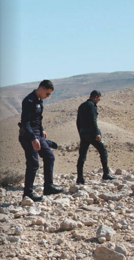
CTBTO on-site inspection regional training course conducted in Cape town, South Africa with participants from 33 African countries