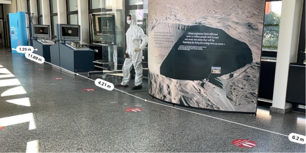
IMAGE 3 - East corridor in Building E hallway