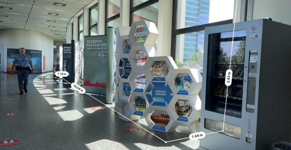
IMAGE 4 - North wall in Building E-hallway