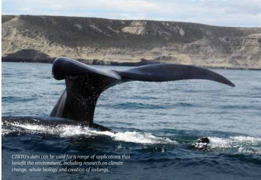
CTBTO's data can be used for a range of applications that benefit the environment, including research on climate change, whale biology and creation of icebergs.

CTBT data have many potential civil and scientific applications. These include natural disaster warning, research on the Earth's core, monitoring earthquakes, tsunamis and volcanoes, meteor research and climate change research, to name but a few. The CTBTO is already providing real-time monitoring data to tsunami-warning centres in the Indian and Pacific Oceans helping them to issue tsunami warning alerts several minutes earlier than other systems.