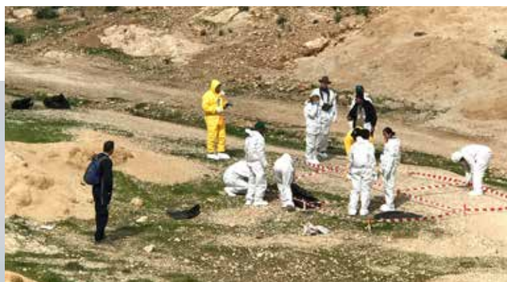
LEFT: CTBTO on-site inspection exercise in Bruckneudorf, Austria (set-up of a base of operations) RIGHT: Integrated on-site inspection exercise carried out near the Dead Sea area of Jordan

The CTBT verification regime is a unique global alarm system with a set of impressive and sophisticated tools to monitor the planet for any nuclear explosion. Member States have the right to access all raw data and analysis products resulting from observations made by this system. It is their prerogative to draw final conclusions about a suspicious event based on information provided by the verification regime. Should data and data analysis point to a possible violation of the CTBT, Member States can take measures to ensure compliance with the Treaty. Such measures include bringing the case to the attention of the United Nations.