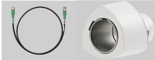
Image cable and mounting kit

c) It shall be possible to set up using configuration software.