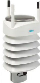
Image of Vaisala WTX536

b) The weather stations shall be supplied with a mounting kit(s) and connection cables.