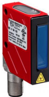
Image of barcode reader